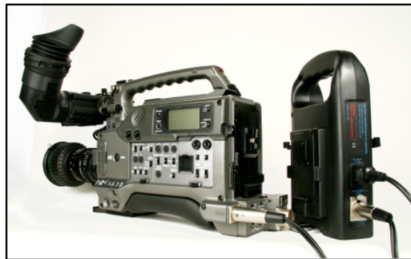
2. 12V DC Adapter Operation