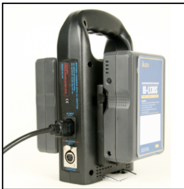
1. Charging Operation